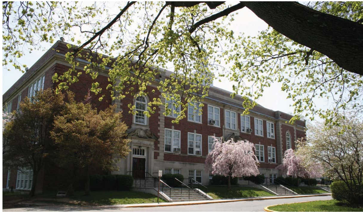
Alexander Hamilton High School Elmsford, New York