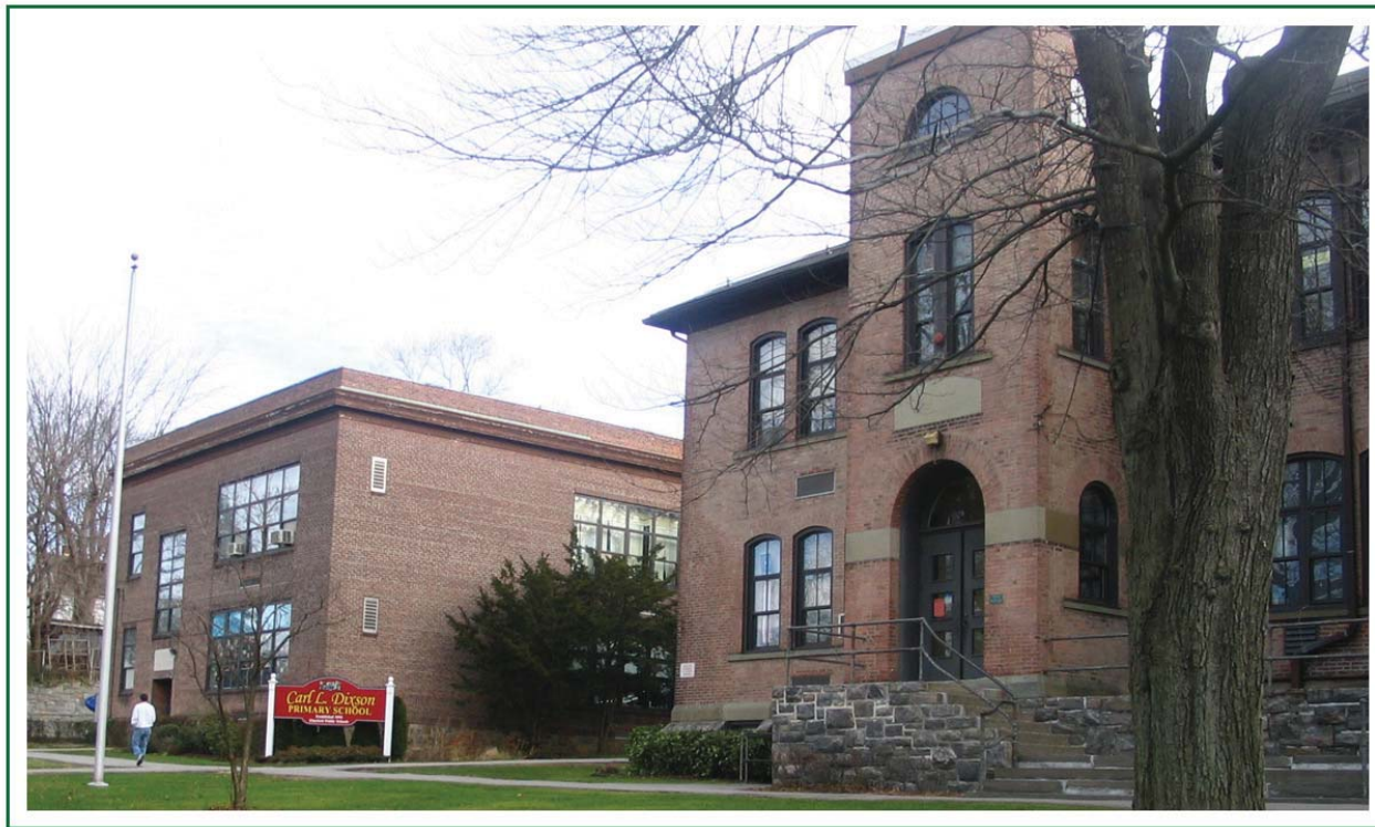
Carl L. Dixon Primary School Elmsford, New York