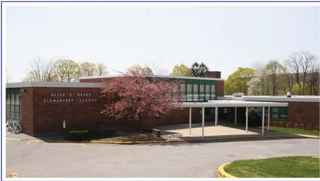
Alice E. Grady Elementary School Elmsford, New York